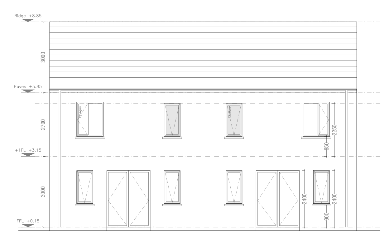
House Type K2 Semi-Detached Rear Elevation