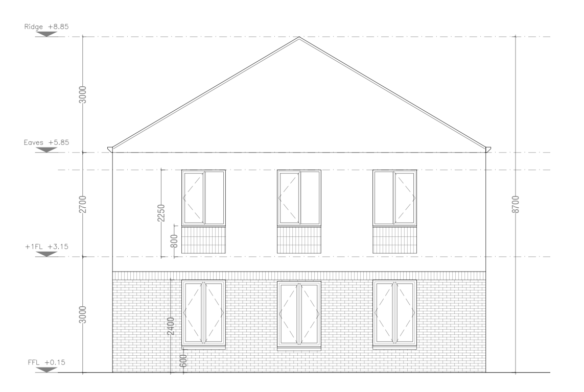
House Type K2 Semi-Detached Side Elevation